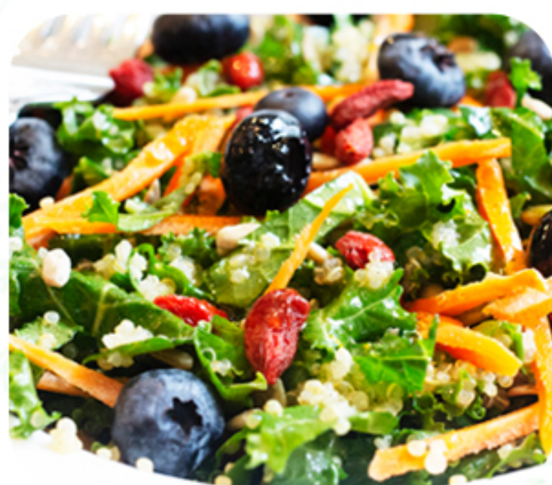
Immune Boosting Salad