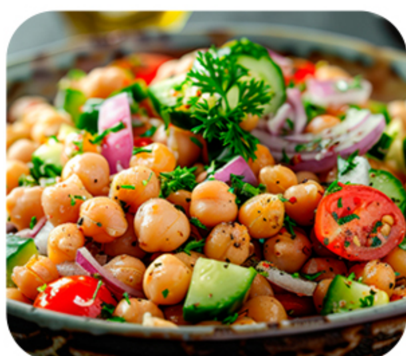
Weight Loss Salad