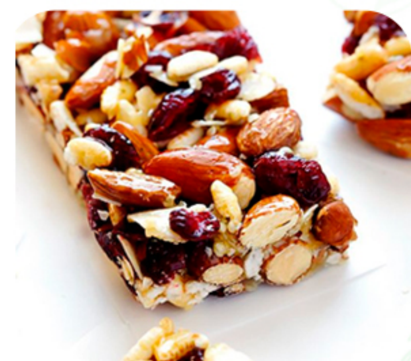
Dry Fruit Protein Bars